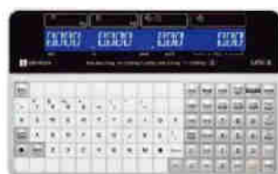
L1 TYPE DISPLAY