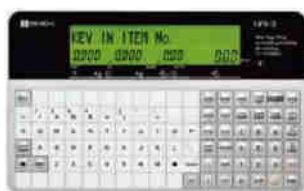
L2 TYPE DISPLAY

The UNI-3 model variants are available with two display types: The UNI-3 L1 models have a blue backlite display with sharp white 16-segment display capable of showing momentarily the PLU name and swap to numeric data; The UNI-3 L2 models, come with a two-line green/orange backlite liquid crystal display, one line dot matrix alphanumeric and one line numeric only.